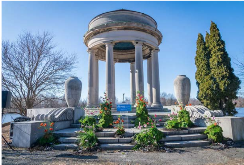
The gazebo at FDR Park, the site of this year's Philadelphia Flower Show.