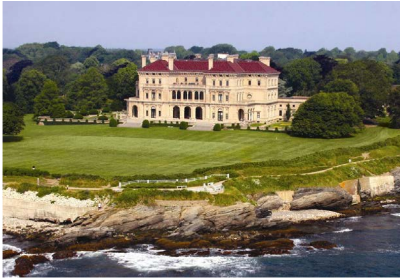
Eight concerts during the Newport Music Festival are scheduled to take place on The Breakers Lawn. The Preservation Society of Newport County